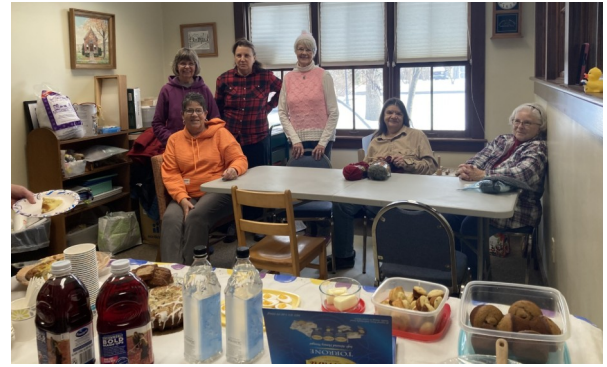
Fiber Arts Club (formerly Knit Club)

Game Days during Winter and Spring Break